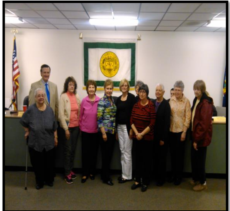
Volunteers from our Senior Center Book Sale were honored by the Clifton Park Town Board on Monday, 6/5/2017.

Tavern, Bar, Grill, Catering & Banquets 1021 Rt 146 Clifton Park NY 12065 Phone: 518-371-8771 Ravenswoodpub.com Email: ravenswoodpub@outlook.com Follow us on Facebook