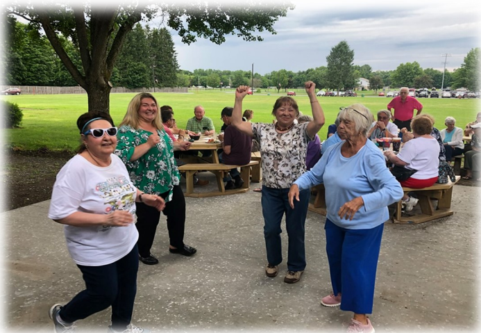
2019 May Dinner brought to us by Classic Crust Catering! Dancing and fun was had by all!