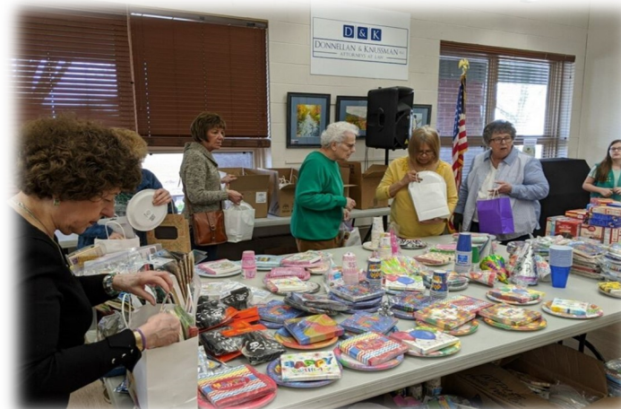
2020 March Birthday Party Service Project.