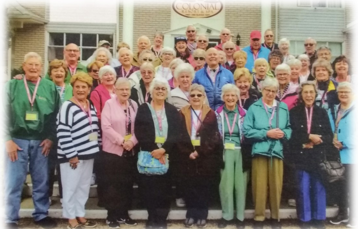
2019 Thousand Islands Trip