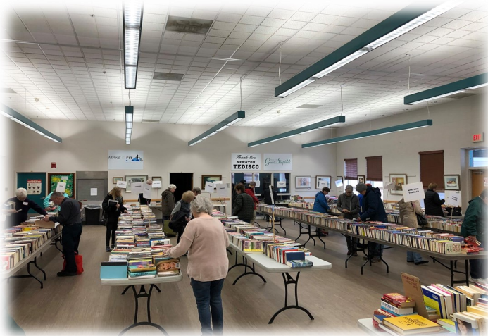
2019 Spring Book Sale!