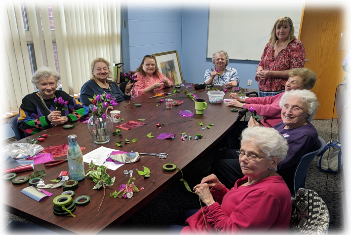
Flower wreath making during our Senior Center Craft Class.