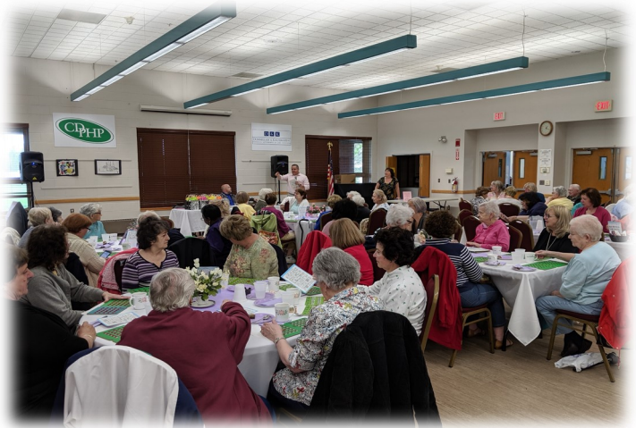
2019 Mother's Day Tea and Bingo.